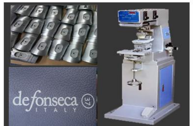
Pad Printing Machine