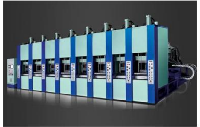
EVA injection machine