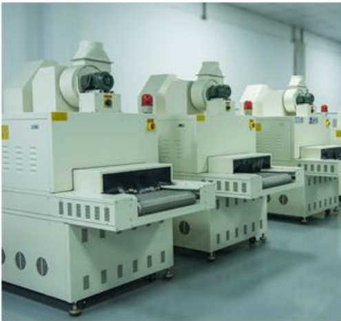
UV light machine