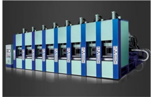
EVA injection machine