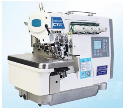
automatic welting machine