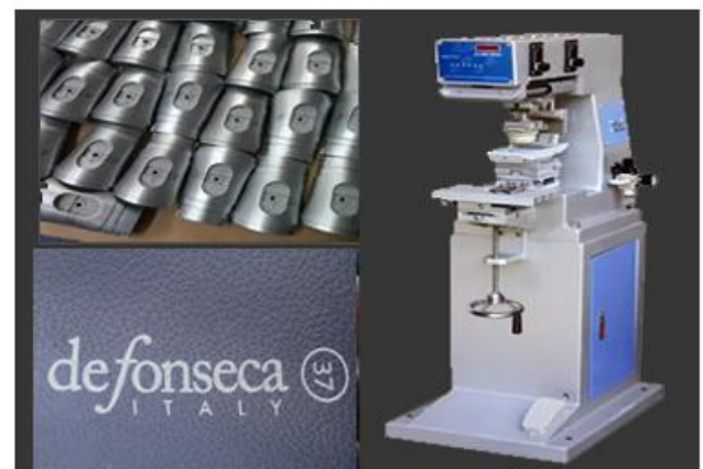
Pad Printing Machine